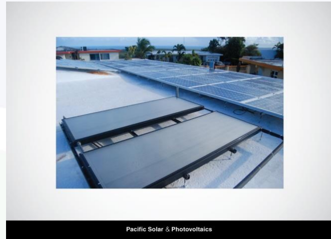
Pacific Solar & Photovoltaics